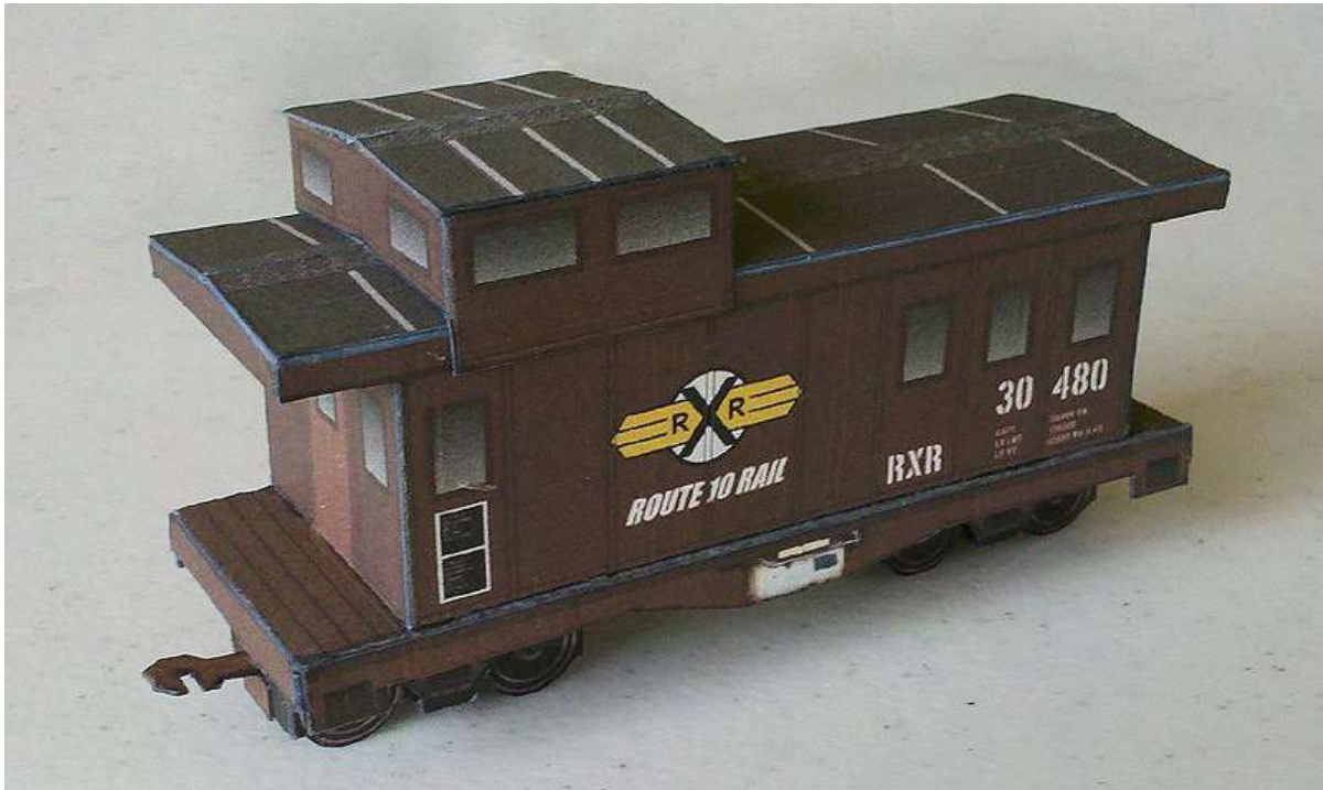
RXR 30ft Caboose